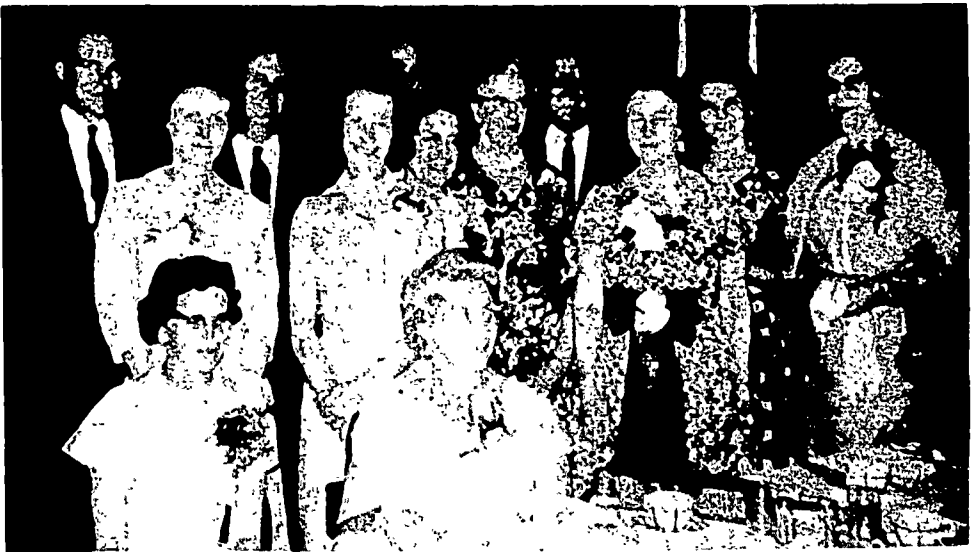
Class of "37"